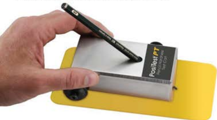
Pencil Cart included with the Complete Kit