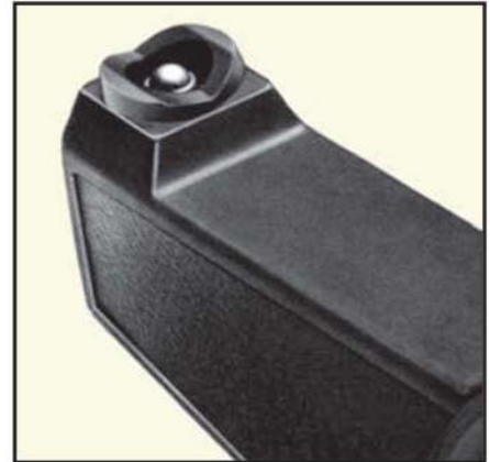
Carbide measuring probe for long life.

FOR: Hot dip galvanizing, hard chrome metalizing, paint, enamel coatings on steel