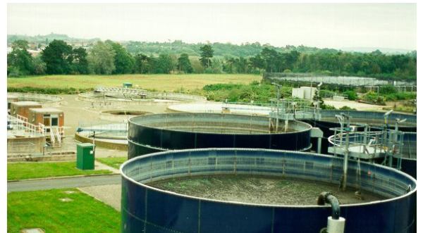
Sludge settlement tanks at a Sewage Treatment Works.

Sludge Finder 2 is designed to be maintenance-free. Sludge Finder's Viper transducer is a single beam ultrasonic unit immersed just below the liquid surface. A wiper blade sweeps the transducer face, ensuring that it remains clean. The Viper transducer may be positioned up to 200 m (656.2 ft) from the control unit and has a measurement range of 300 mm to 10 m (11.8 in to 32.8 ft). Accuracy is 0.25% of the measured range. A tight 6-degree beam angle and sophisticated echo processing algorithms make sure that Sludge Finder 2 deals with difficult tanks and rotating equipment with ease.