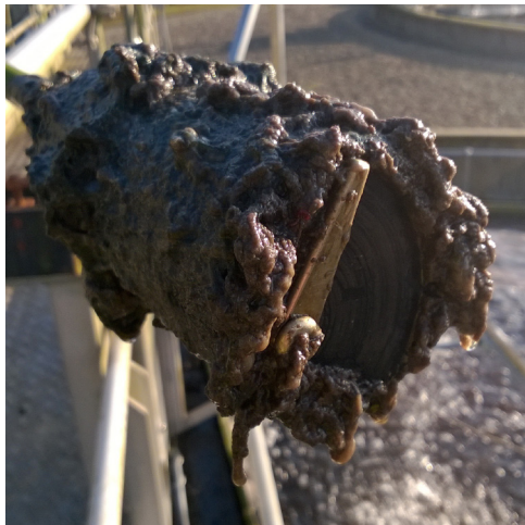
Viper transducer doing it's job!