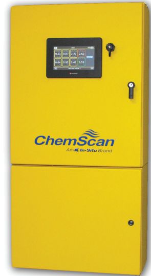
New Model with Graphic Interface

ChemScan on-line analyzers provide operators and control systems with timely process chemistry measurements. These data are used to control and optimize the process resulting in increased plant capability, reduced energy and chemical usage along with monitoring the process for compliance.