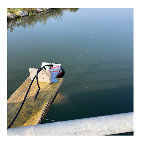
River Monitoring with Small Surface Disturbances