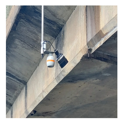
FarSight<sup>™</sup> and REFLECT<sup>™</sup> mounted with dBA0008 angled mounting bracket for areavelocity flow measurement