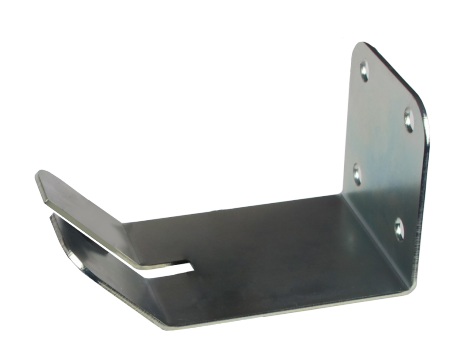
FarSight<sup>™</sup> angled bracket

Thanks to Pulsar Measurement's world-renowned non-contacting technology, the FarSight™ sensor is maintenance free. The sensor does not come into contact with the measurement medium, therefore wear and tear issues are eliminated, and routine maintenance is minimized.