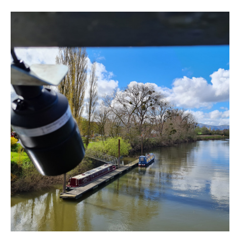
River Monitoring with Large Distance to Surface