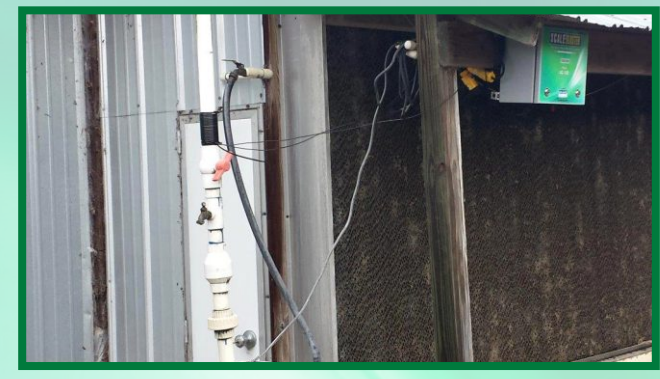
ScaleBlaster installed on a cool pad at a Georgia poultry farm