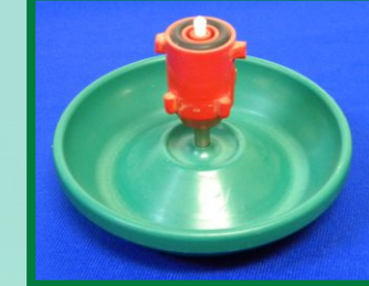
Six weeks after ScaleBlaster installed

"... I appreciate the ScaleBlasters that we've got from you. They work great and I look forward to putting them in all our barns to save money and labor."