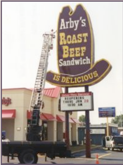
This remodeled Tulsa, Oklahoma Arby's is scale-free.