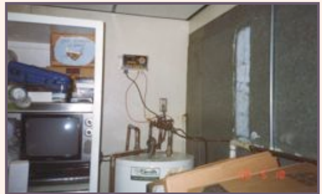
This Norman, Oklahoma store was the first Arby's in the state to get a ScaleBlaster installed ( model # SB-200 ).