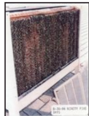
NINETY-FIVE DAYS AFTER INSTALL