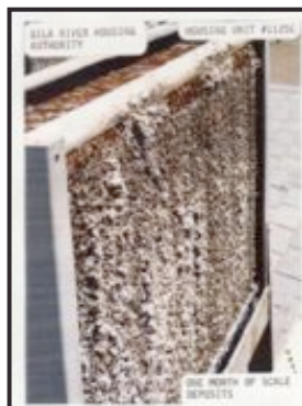
ONE MONTH OF SCALE DEPOSITS