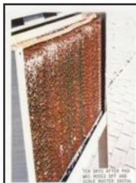
TEN DAYS AFTER PAD WAS HOISTED OFF AND SCALEBLASTER INSTALL