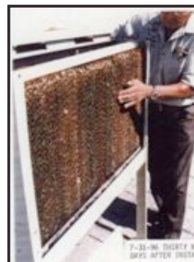
THIRTY-NINE DAYS AFTER INSTALL