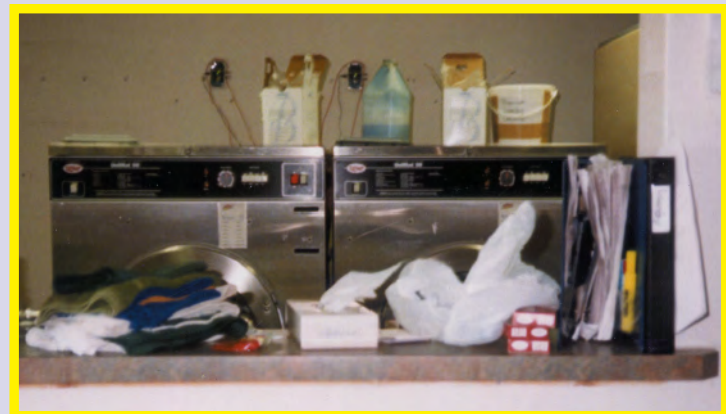
Individual units (pictured to the left) were installed on the hot and cold water lines going to the washing machines (see photograph to the right). The Holiday Inn is saving $4,800 annually on laundry and bleach expenses just from this application alone.