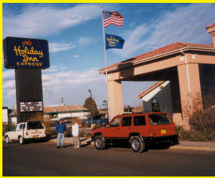
The Holiday Inn Express, Socorro, New Mexico

The 80-unit hotel, located about 78 miles south of Albuquerque, has always experienced problems from the hard water and calcium buildup on plumbing fixtures. Because of the hard water, a tremendous amount of laundry soap and supplies were required to wash the towels, bed sheets and other items on a daily basis. Extra labor costs were incurred from cleaning the hotel bathrooms, where white calcium deposits were accumulating in the shower heads and around faucets and in the toilets.