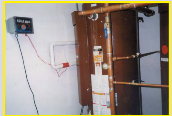
A large ScaleBlaster™ unit was installed at the incoming water source on 1 1/2" PVC pipe going to the hotel.

Additional savings are realized from less labor required to clean the bathrooms from scale deposits and from scale deposits clogging up the shower heads. The fixtures and plumbing equipment are lasting a lot longer because scale is no longer forming.