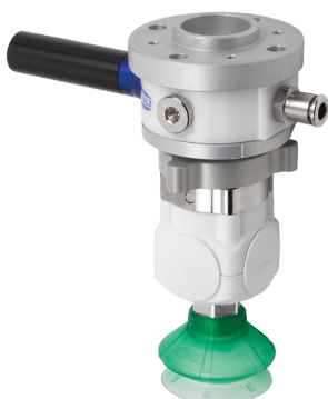
Handling Sets VEE