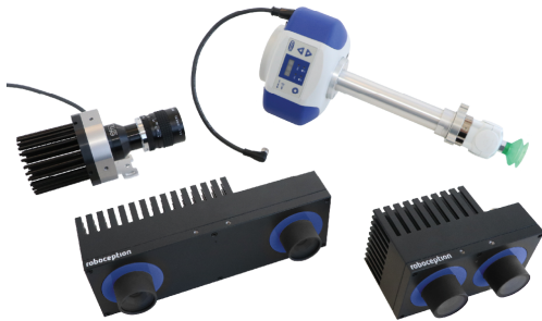
Vision & Handling Sets 3D-R