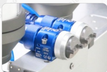
Dual spray gun