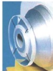
Cross Locating, Large Stable End Face