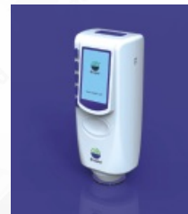
Small Concave-Convex End Face