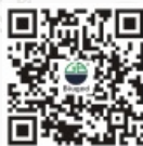
Scan for video