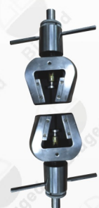
Wedge Clamp for Metal