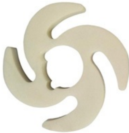
Ceramic Sand Mill Blade with Disk Structure