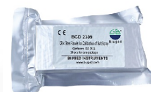
CR-4 Steel Panels