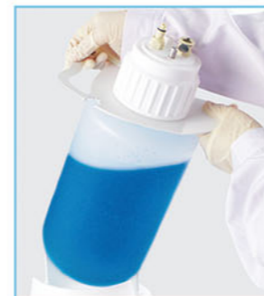
Stand for transferring the bottle securely and holding the hand operator