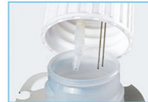
Sensitive level sensor to prevent liquid overflow