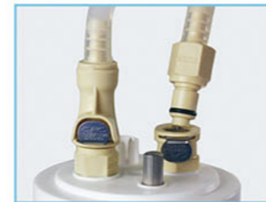
Self-closing connectors to avoid escape of drops or aerosols from disconnected bottle