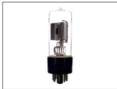
Deuterium Lamp: Ultraviolet light source