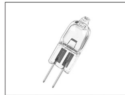
Tungsten Lamp: Visible light source