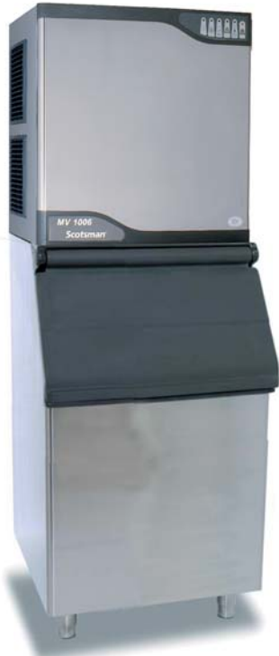
MV 1006 with SB530 (sold separately)