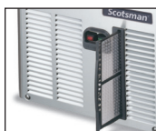
Proximity condenser air filter