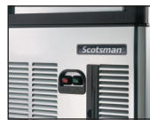
Front ON-OFF Switch Routine Maintenance Alarm