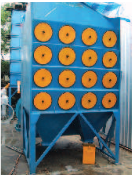
Model 4DF32 Dust Collector

A wide range of sizes are possible in construction. Listed below is some of the common sizes available.