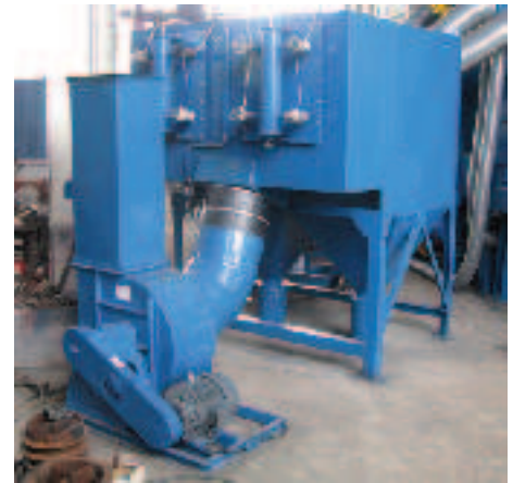
Model 2DF16 Dust Collector

A wide range of sizes are possible in construction. Listed below is some of the common sizes available.