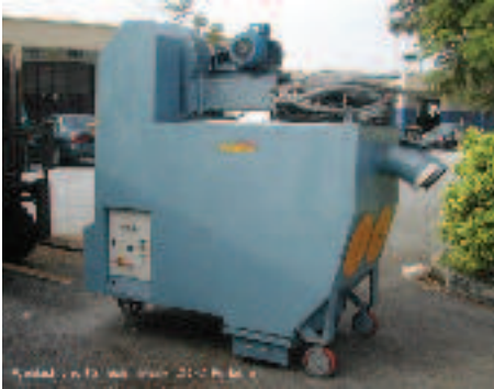
Model 1DF4 Portable Dust Collector on Wheel

PULSE JET CLEANED CARTRIDGE COLLECTORS ARE THE MOST COMPACT IN CONSTRUCTION AMONG ALL OTHER DESIGNS OF DUST COLLECTORS. WIDE RANGE OF APPLICATIONS INCLUDING WELDING, FOOD PROCESSING, WOODWORKING, METAL WORKING, VACUUM CONVEYING, ETC.