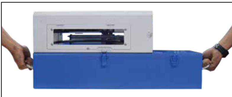
Handle for easy Portability