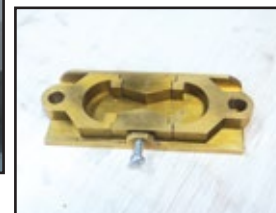
Briquette Mould c/w Base Plate