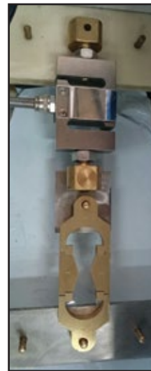
1000N Load Cell with Mould Guide Piece