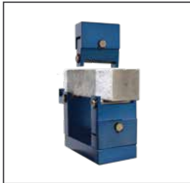
NL 3027 X 002 - P003