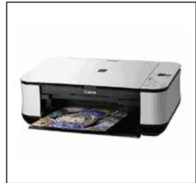
NL CP - 200