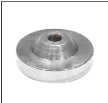
NL 3033 X 003 - P002