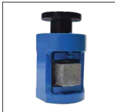
NL 3033 X 003 - P001