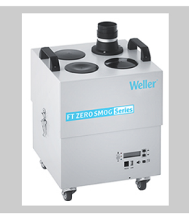
Fume extraction devices