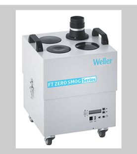
Fume extraction devices