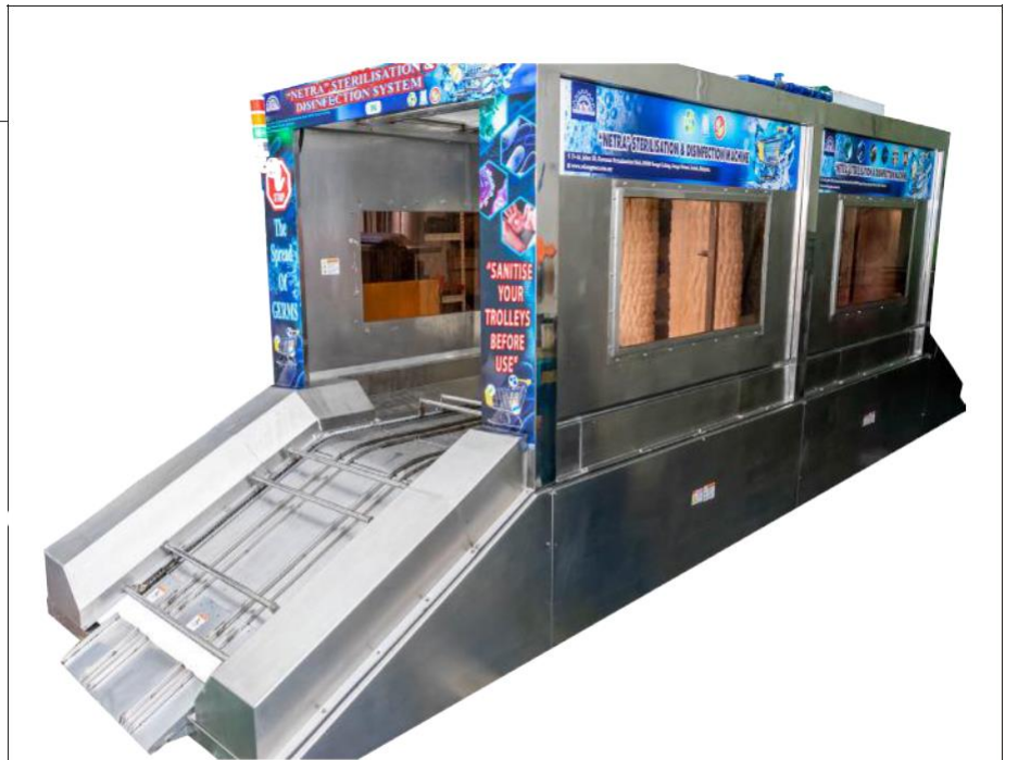
"NETRA" Trolley sanitisation

Hosts of viruses, bacteria and germs are transmittable through commonly-touched surfaces, providing the opportunity for REK to market its solutions.