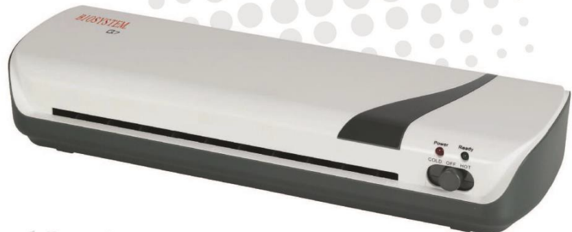
A4 Size Personal Laminator