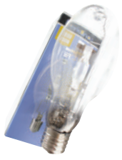
150W MH BULB