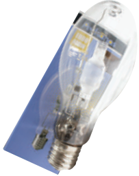
250W MH BULB