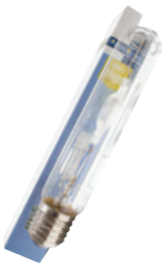
250W MH TUBE