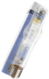
400W MH TUBE