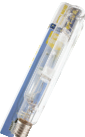
1000W MH TUBE