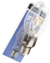
400W MH BULB