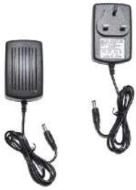
12V 3A ADAPTOR