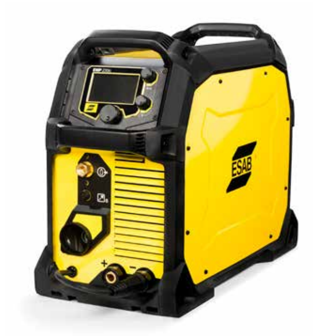
Rebel EMP 235ic