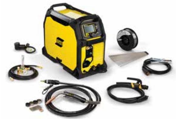
Rebel EMP 235ic complete package.