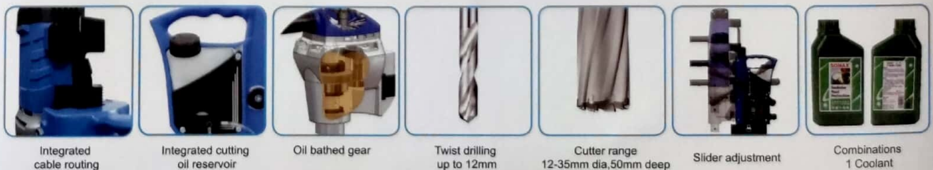
Integrated cable routing