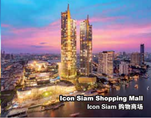
Icon Siam Shopping Mall Icon Siam 购物商场