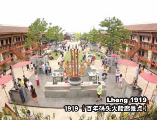
Lhong 1919 1919 (百年码头火船廊景点)