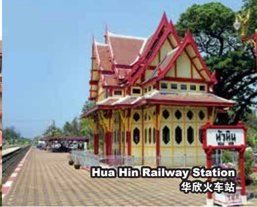
Hua Hin Railway Station 华欣火车站