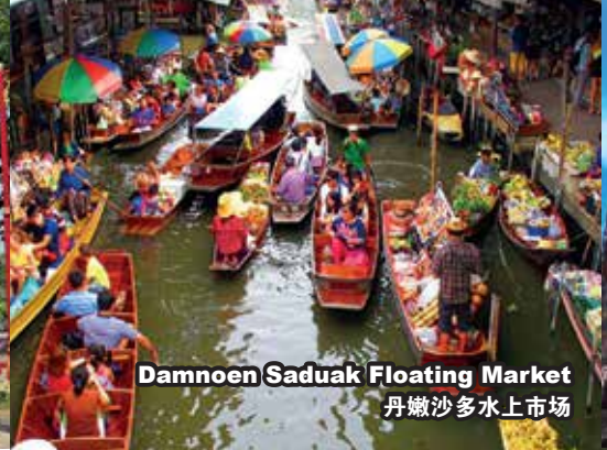
Damnoen Saduak Floating Market 丹嫩沙多水上市场