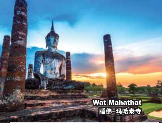
Wat Mahathat 睡佛-玛哈泰寺