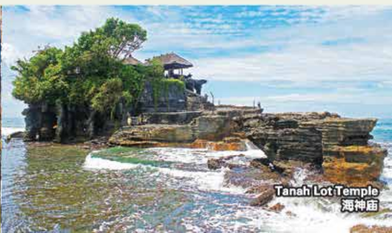
Tanah Lot Temple 海神庙