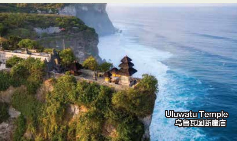
Uluwatu Temple 乌鲁瓦图断崖庙