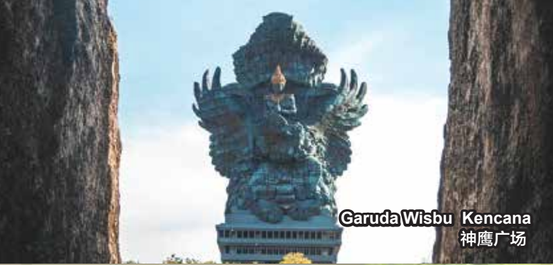
Garuda Wisbu Kencana 神鹰广场