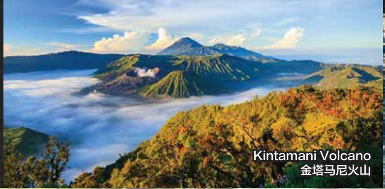
Kintamani Volcano 金塔马尼火山