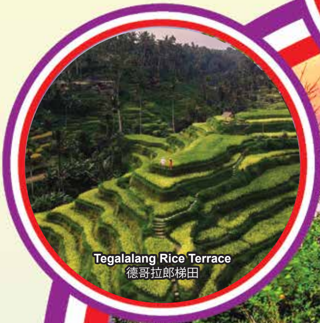
Tegalalang Rice Terrace 德哥拉郎梯田