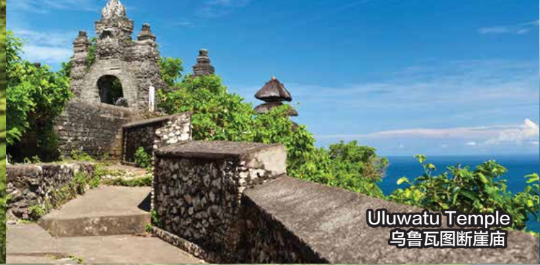
Uluwatu Temple 乌鲁瓦图断崖庙