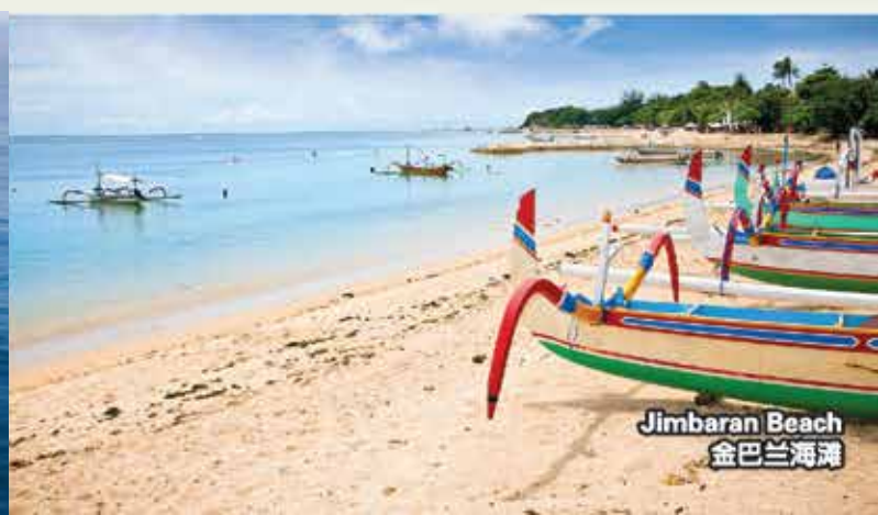
Jimbaran Beach 金巴兰海滩