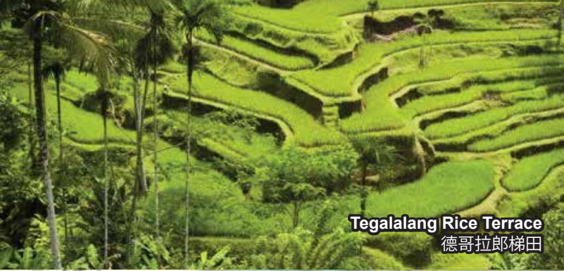
Tegalalang Rice Terrace 德哥拉郎梯田