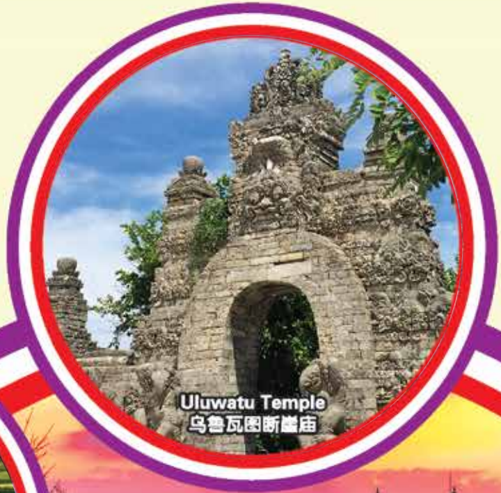
Uluwatu Temple 乌鲁瓦图断崖庙