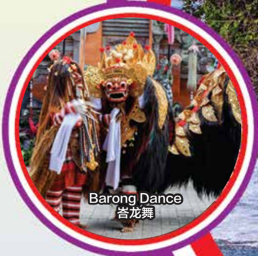
Barong Dance 峇龙舞

行程次序·以当地旅社安排为准· Sequences of itinerary are subject to local arrangement.