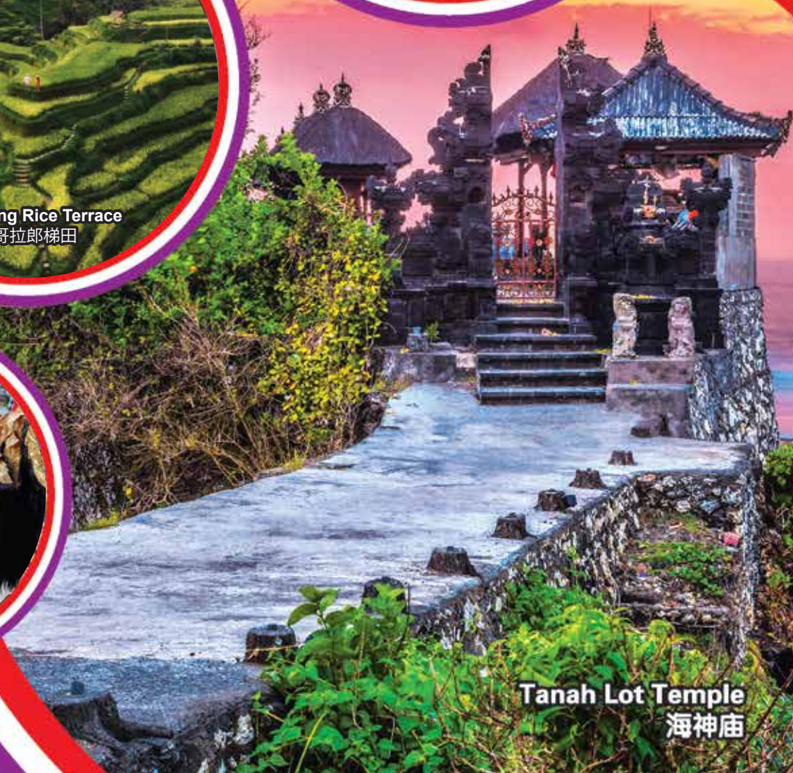
Tanah Lot Temple 海神庙

行程次序·以当地旅社安排为准· Sequences of itinerary are subject to local arrangement.