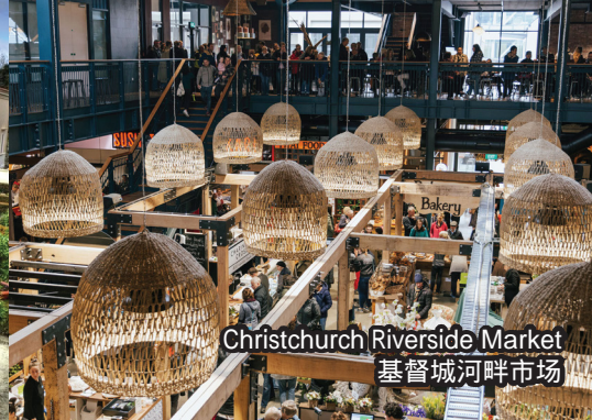
Christchurch Riverside Market 基督城河畔市场