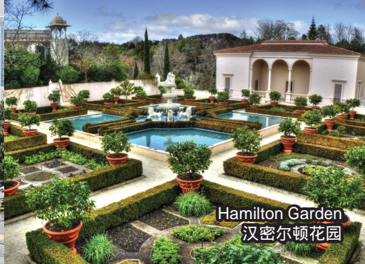
Hamilton Garden 汉密尔顿花园