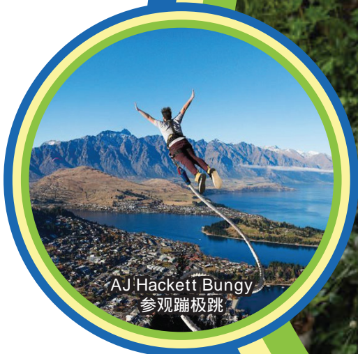
AJ Hackett Bungy 参观蹦极跳