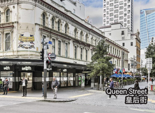
Queen Street 皇后街