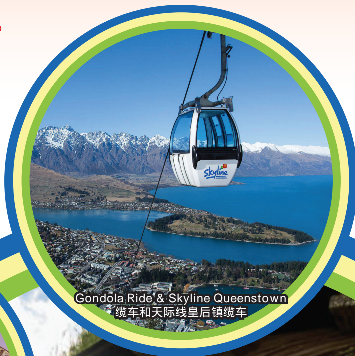
Gondola Ride & Skyline Queenstown 缆车和天际线皇后镇缆车