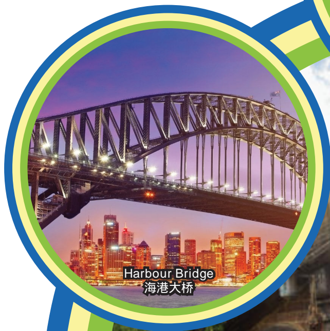
Harbour Bridge 海港大桥