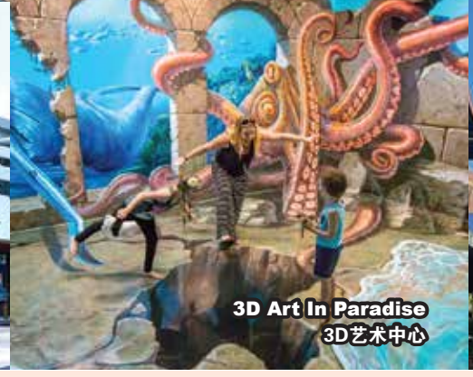
3D Art In Paradise 3D 艺术中心