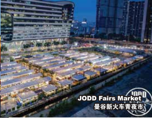
JODD Fairs Market 曼谷新火车青夜市