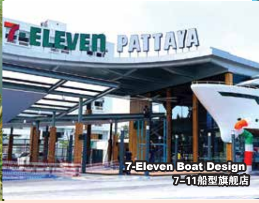
7-Eleven Boat Design 7-11 船型旗舰店