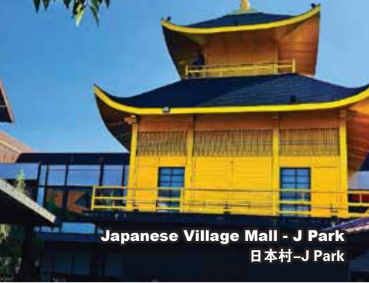
Japanese Village Mall - J Park 日本村-J Park