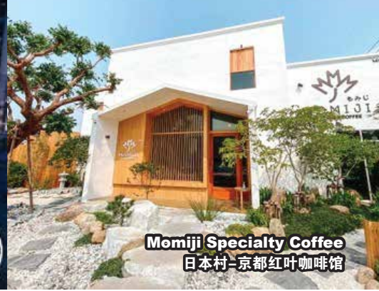
Momiji Specialty Coffee 日本村-京都红叶咖啡馆