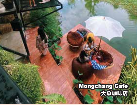
Mongchang Cafe 大象咖啡店