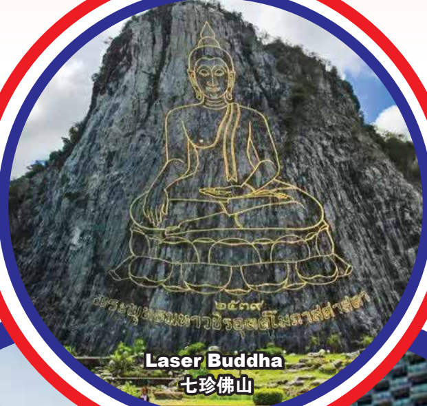
Laser Buddha 七珍佛山