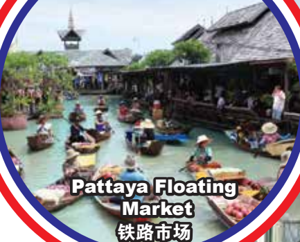
Pattaya Floating Market 铁路市场