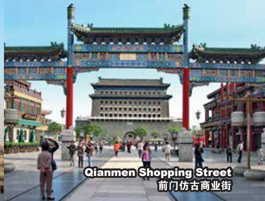
Qianmen Shopping Street 前门仿古商业街