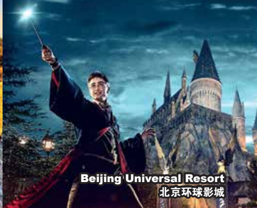
Beijing Universal Resort 北京环球影城