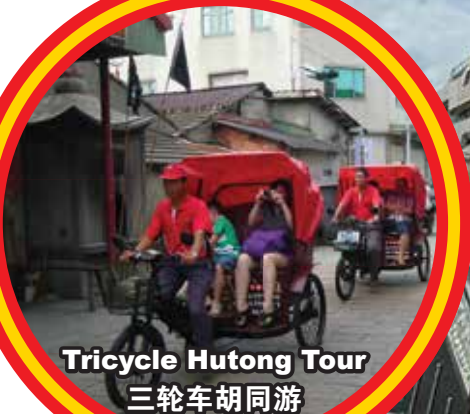
Tricycle Hutong Tour 三轮车胡同游