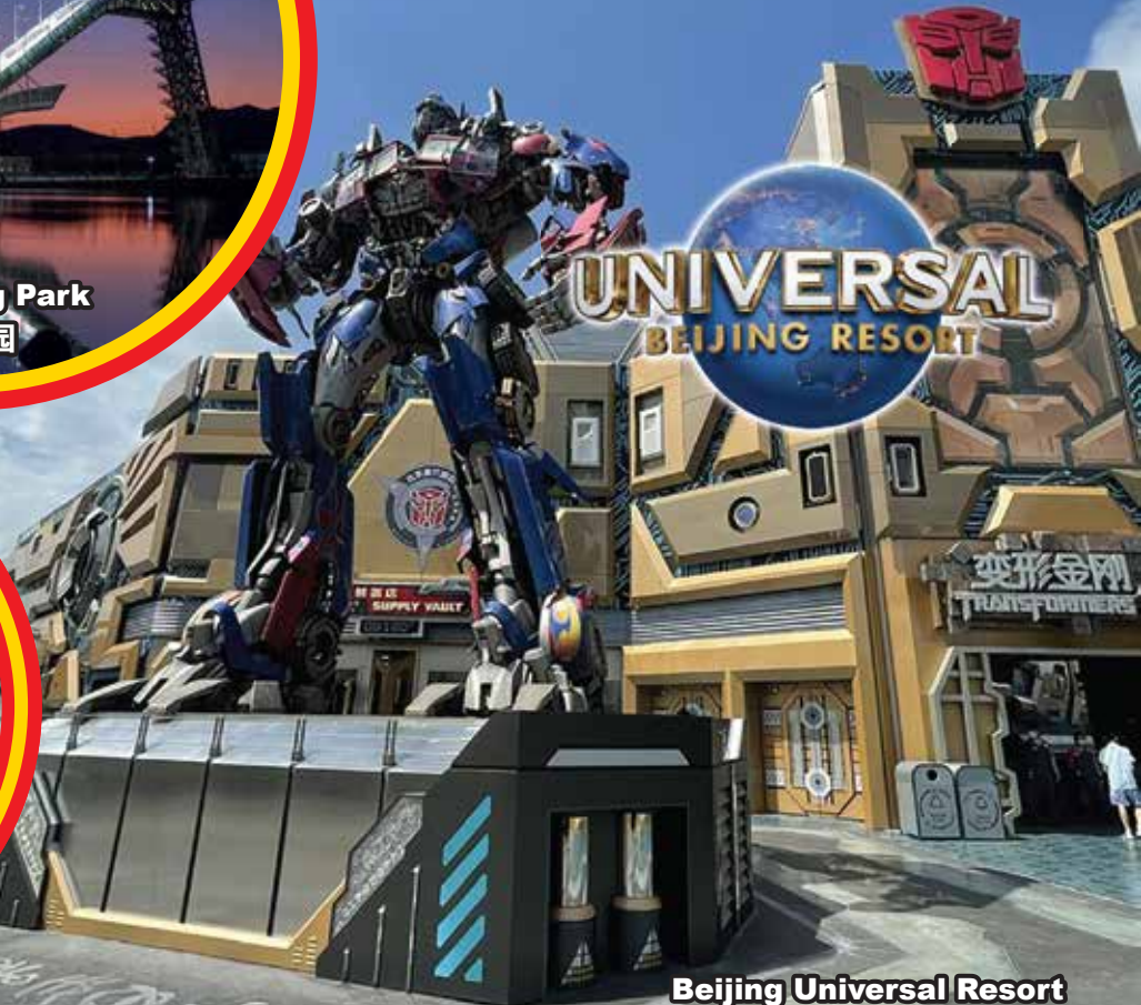
Beijing Universal Resort 北京环球影城