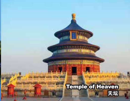
Temple of Heaven 天坛