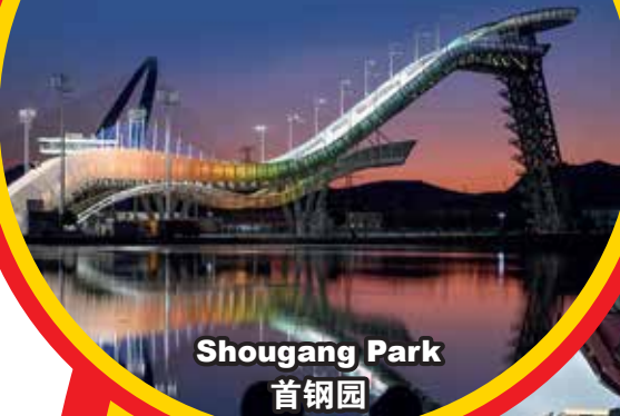
Shougang Park 首钢园