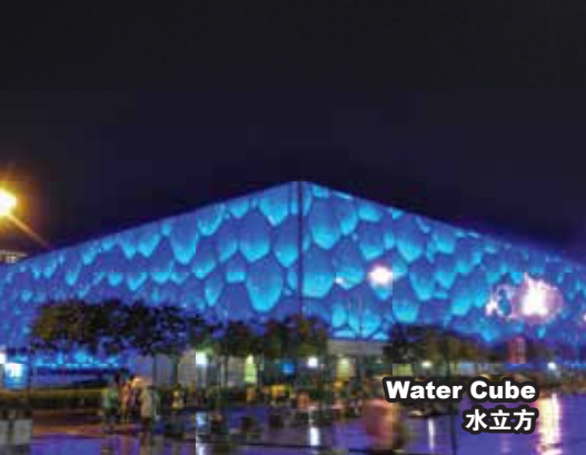
Water Cube 水立方