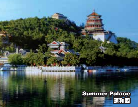
Summer Palace 颐和园