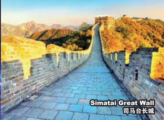
Simatai Great Wall 司马台长城