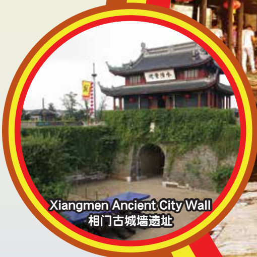
Xiangmen Ancient City Wall 相门古城墙遗址