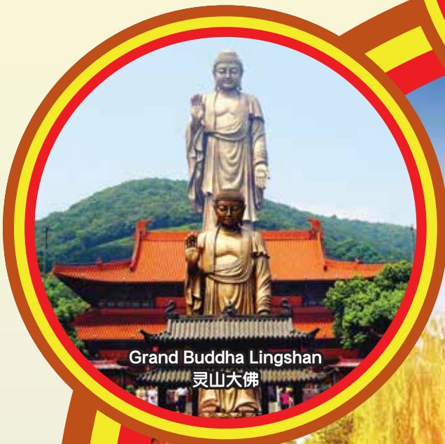
Grand Buddha Lingshan 灵山大佛