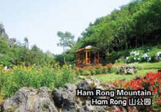
Ham Rong Mountain Ham Rong 山公园