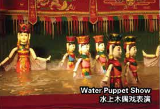
Water Puppet Show 水上木偶戏表演