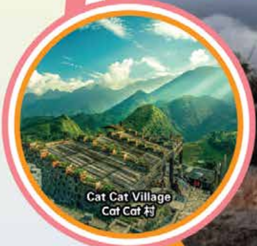
Cat Cat Village Cat Cat 村