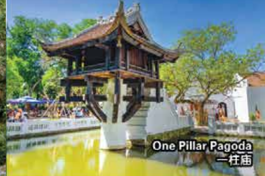
One Pillar Pagoda 一柱庙