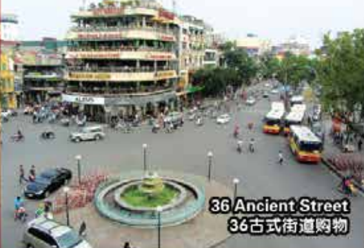
36 Ancient Street 36古式街道购物