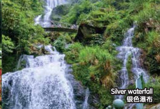
Silver waterfall 银色瀑布