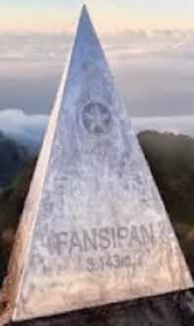
Mount Fansipan 番西邦峰

行程次序·以当地旅社安排为准。 Sequences of itinerary are subject to local arrangement.