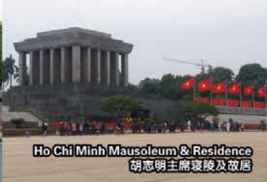
Ho Chi Minh Mausoleum & Residence 胡志明主席寝陵及故居