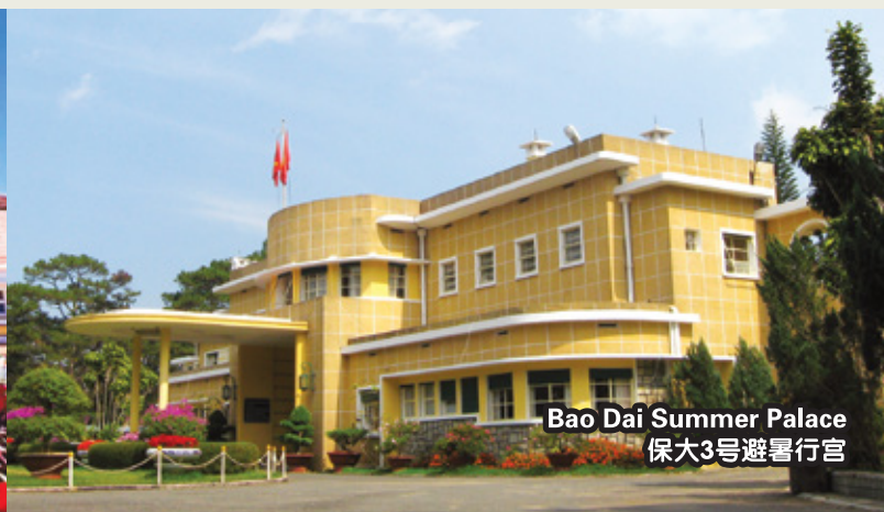
Bao Dai Summer Palace 保大3号避暑行宫