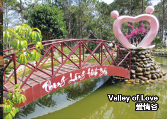
Valley of Love 爱情谷