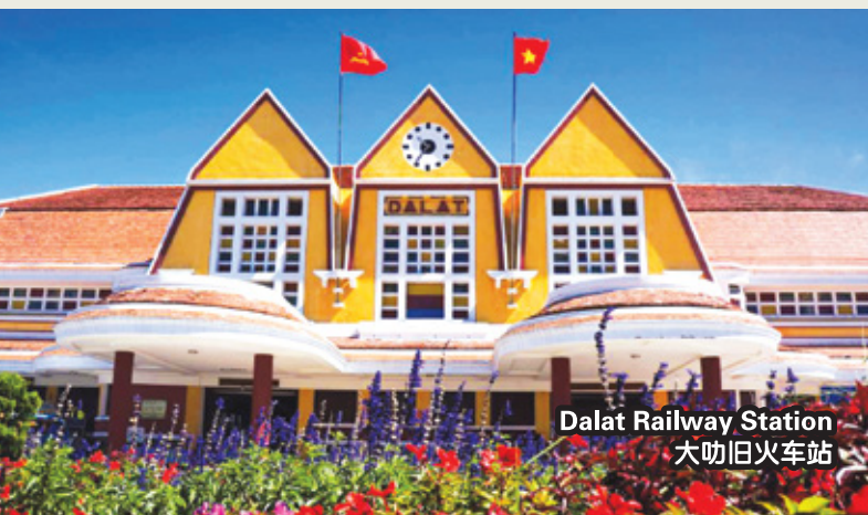
Dalat Railway Station 大叻旧火车站