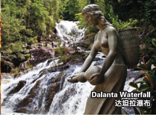
Dalanta Waterfall 达坦拉瀑布