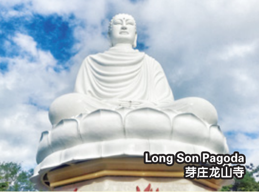
Long Son Pagoda 芽庄龙山寺