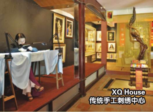
XO House 传统手工刺绣中心