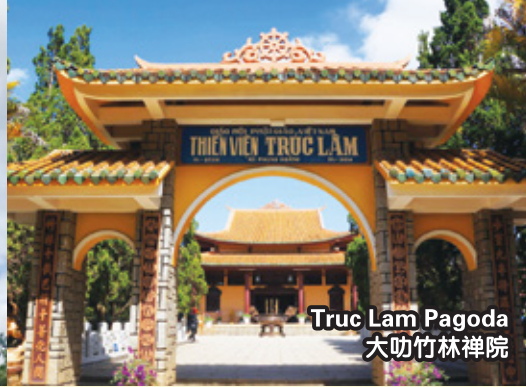
Truc Lam Pagoda 大叻竹林禅院