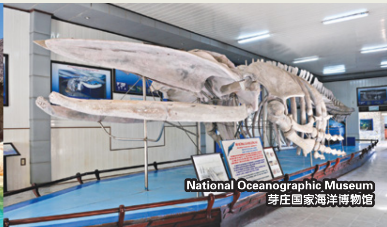
National Oceanographic Museum 芽庄国家海洋博物馆