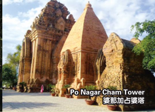
Po Nagar Cham Tower 婆那加占婆塔