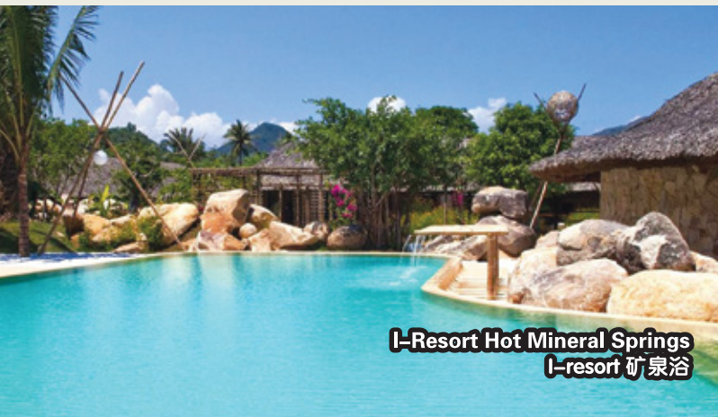
I-Resort Hot Mineral Springs I-resort 矿泉浴