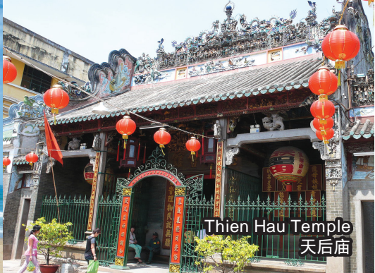
Thien Hau Temple 天后庙