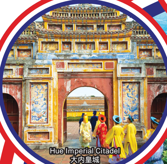
Hue Imperial Citadel 大内皇城