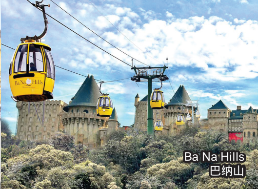
Ba Na Hills 巴纳山