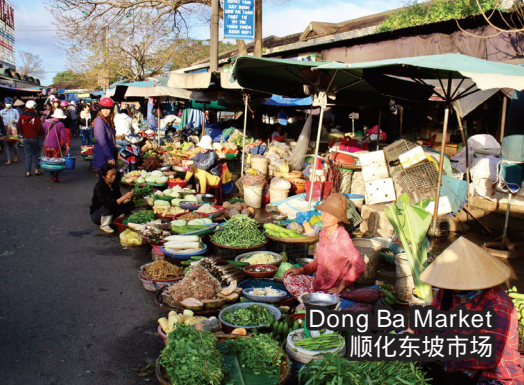
Dong Ba Market 顺化东坡市场