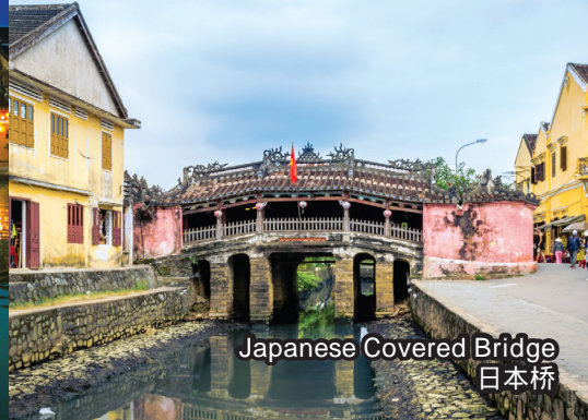
Japanese Covered Bridge 日本桥