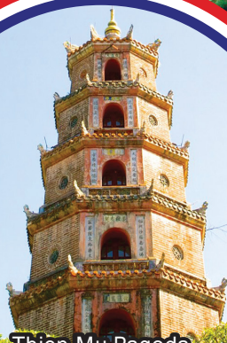
Thien Mu Pagoda 天母寺

行程次序，以当地旅社安排为准。 Sequences of Itinerary are subject to local arrangement.