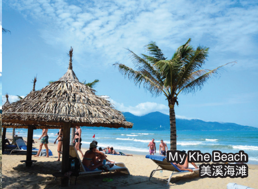
My Khe Beach 美溪海滩