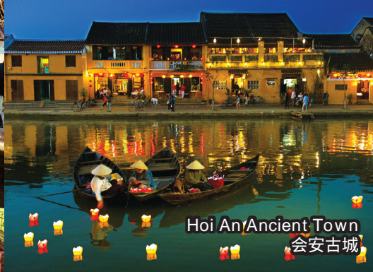
Hoi An Ancient Town 会安古城