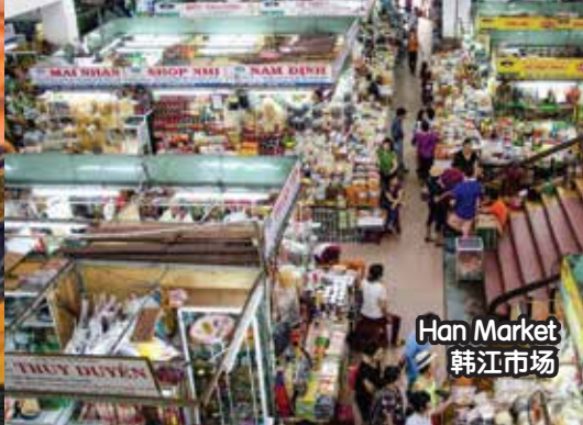
Han Market 韩江市场