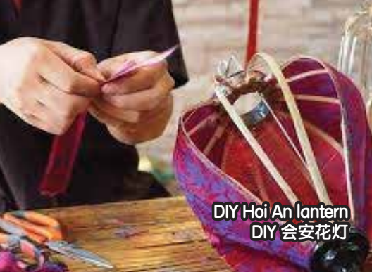
DIY Hoi An lantern DIY 会安花灯