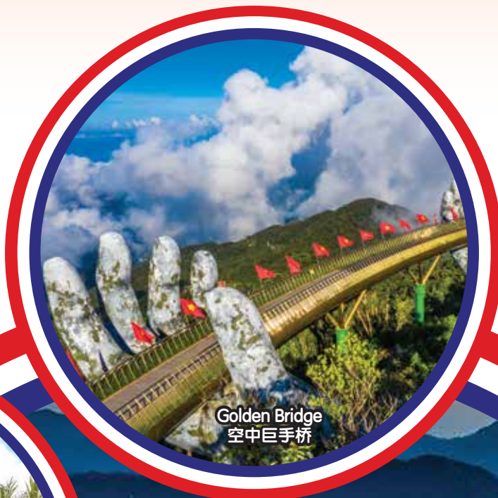
Golden Bridge 空中巨手桥

FREE EXPERIENCE BASKET BOATS @HOI AN 竹篮船体验