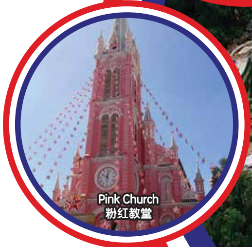
Pink Church 粉红教堂

行程次序，以当地旅社安排为准。 Sequences of Itinerary are subject to local arrangement.