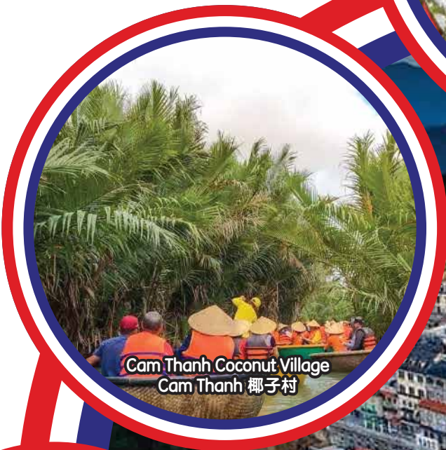
Cam Thanh Coconut Village Cam Thanh 椰子村