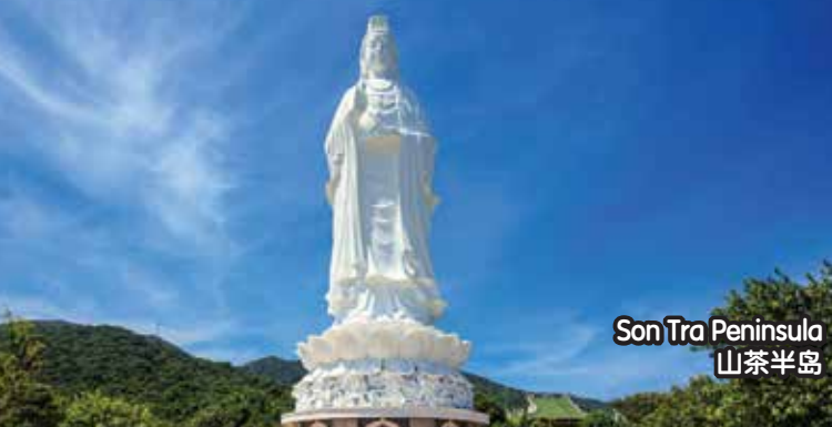
Son Tra Peninsula 山茶半岛