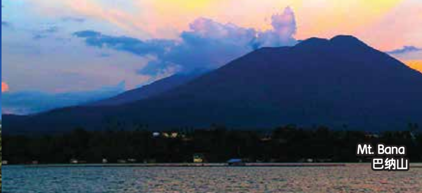
Mt. Bana 巴纳山