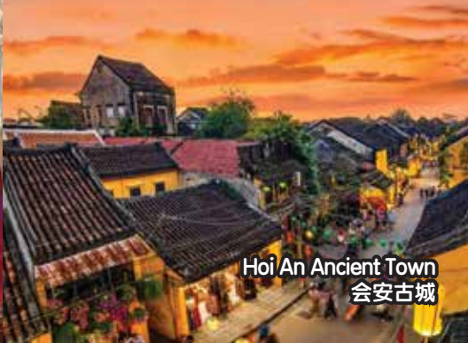
Hoi An Ancient Town 会安古城