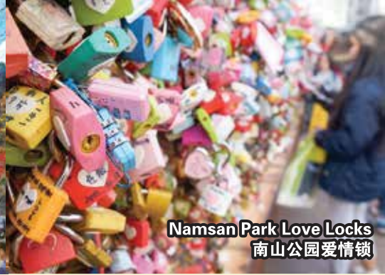
Namsan Park Love Locks 南山公园爱情锁