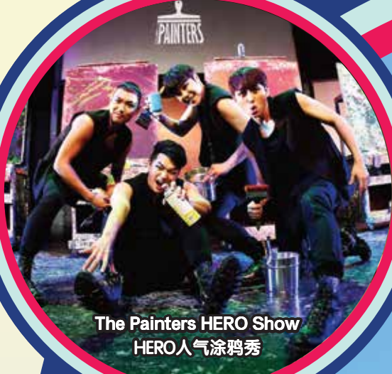
The Painters HERO Show HERO人气涂鸦秀