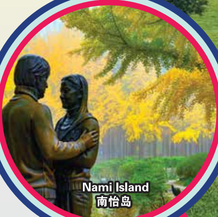
Nami Island 南怡岛