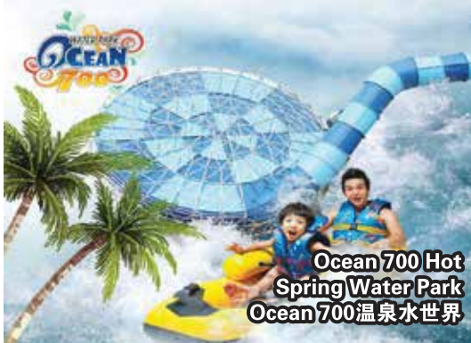
Ocean 700 Hot Spring Water Park Ocean 700 温泉水世界