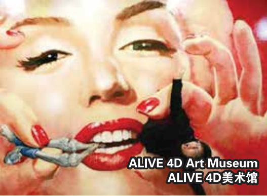
ALIVE 4D Art Museum ALIVE 4D美术馆