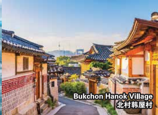
Bukchon Hanok Village 北村韩屋村