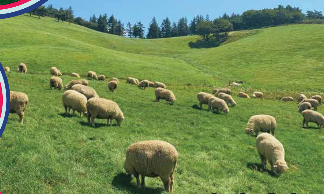
Daegwallyeong Sheep Farm 大美岭风之谷羊牧场

行程次序，以当地旅社安排为准。 Sequences of Itinerary are subject to local arrangement.