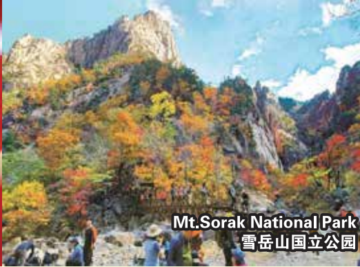
Mt.Sorak National Park 雪岳山国立公园