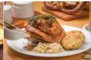
3 Course Meal - German Lunch with Pork Knuckle