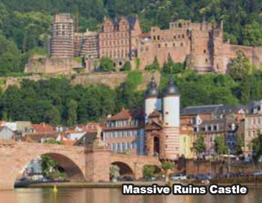
Massive Ruins Castle