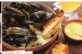
3 Course Meal - Mussels Meals