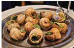
3 Course Meal - French Cuisine with Escargot