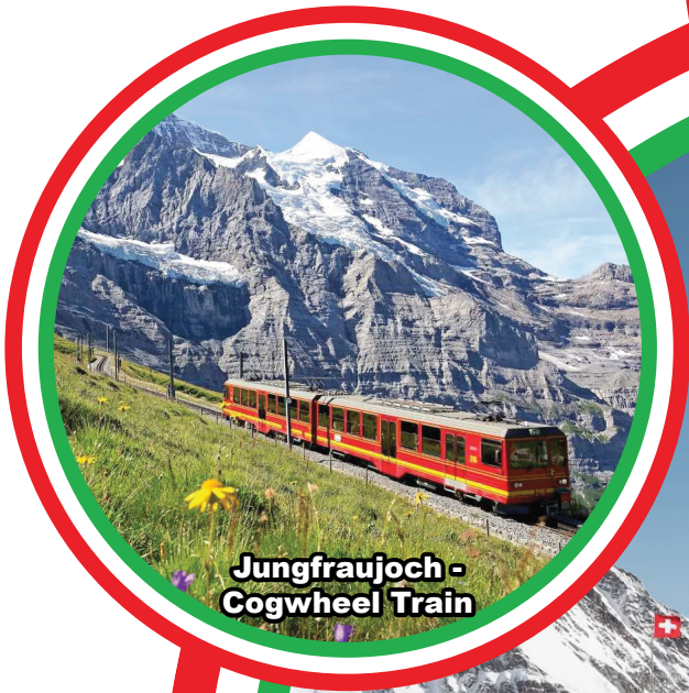
Jungfrauoch - Cogwheel Train