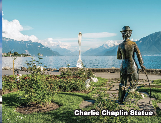
Charlie Chaplin Statue