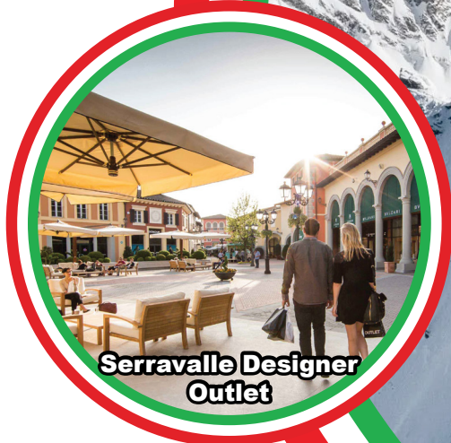
Serravalle Designer Outlet