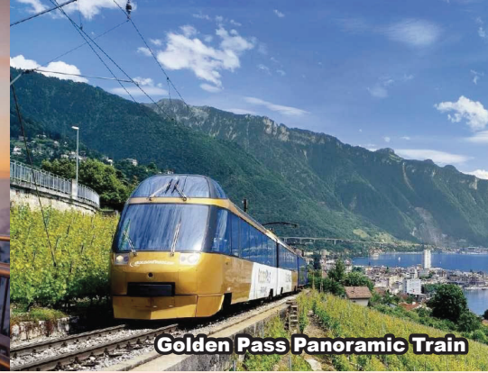
Golden Pass Panoramic Train