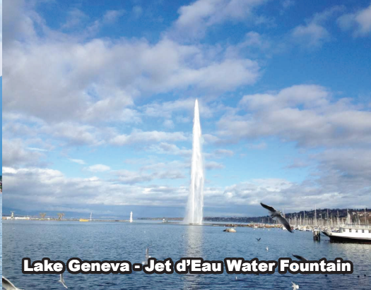
Lake Geneva - Jet d'Eau Water Fountain