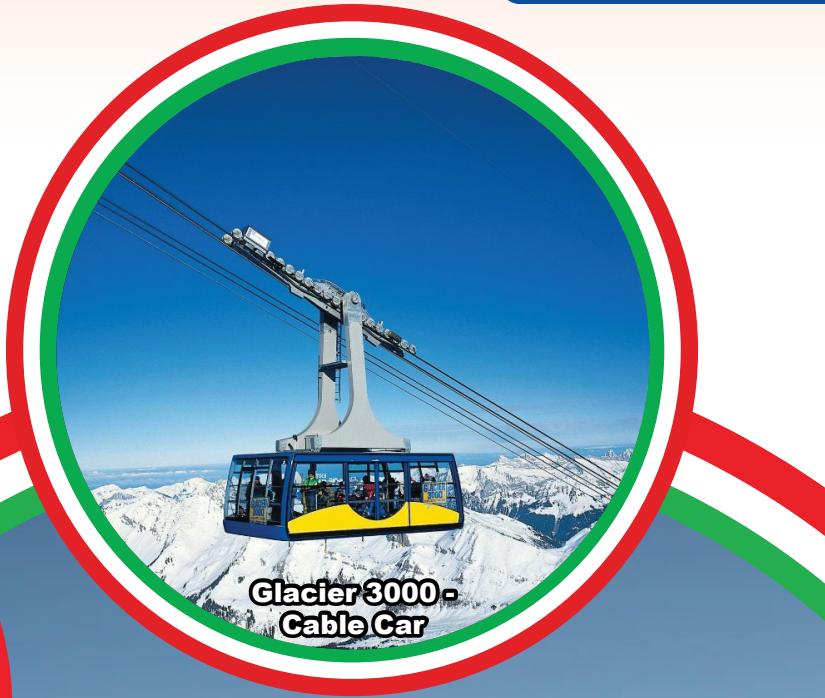
Glacier 3000 - Cable Car