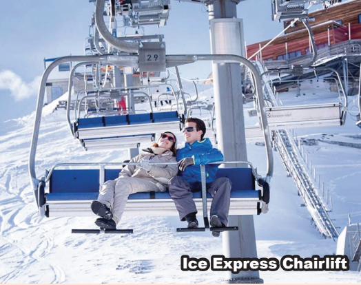
Ice Express Chairlift