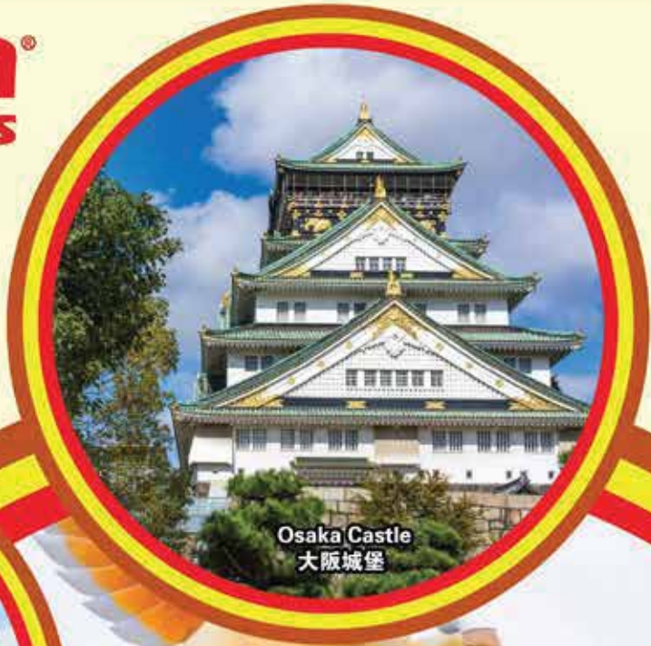
Osaka Castle 大阪城堡