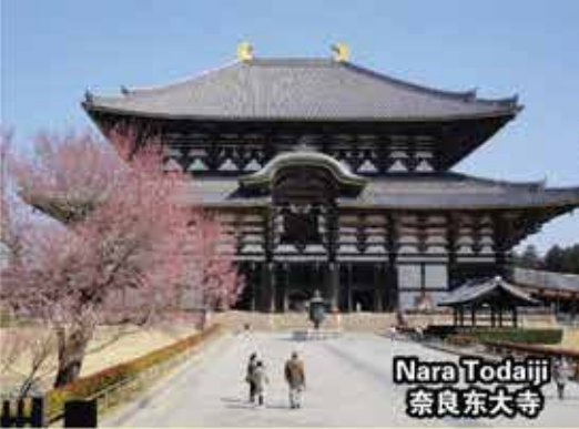
Nara Todaiji 奈良东大寺