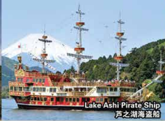
Lake Ashi Pirate Ship 芦之湖海盗船