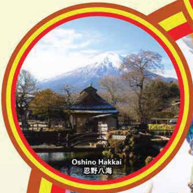
Oshino Hakkai 忍野八海