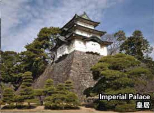
Imperial Palace 皇居