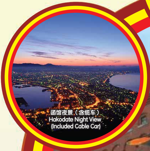
函馆夜景 (含缆车) Hakodate Night View (Included Cable Car)