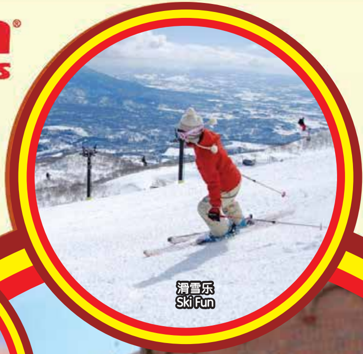
滑雪乐 Ski Fun