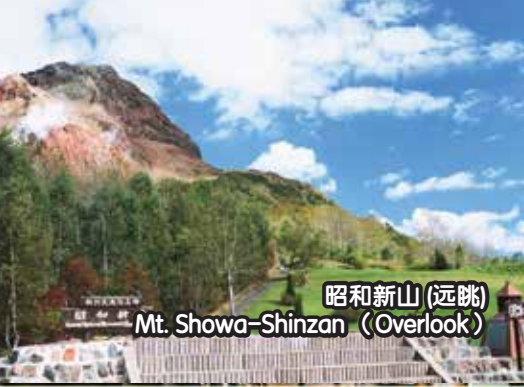
昭和新山 (远眺) Mt. Showa-Shinzan (Overlook)