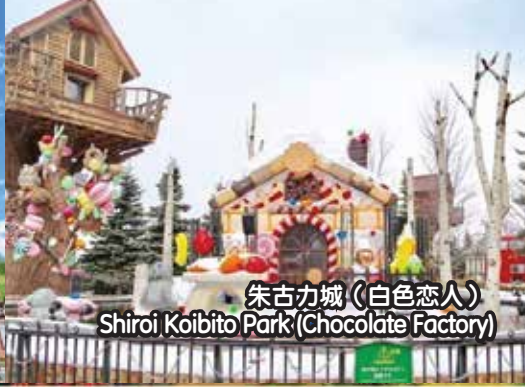
朱古力城 (白色恋人) Shiroi Koibito Park (Chocolate Factory)