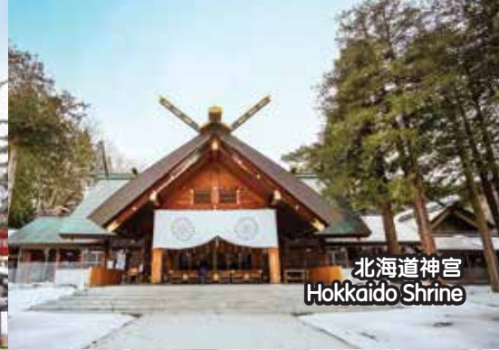
北海道神宫 Hokkaido Shrine