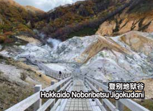
登別地狱谷 Hokkaido Noboribetsu Jigokudani