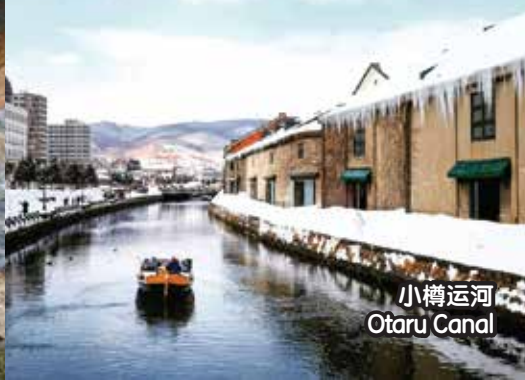
小樽运河 Otaru Canal