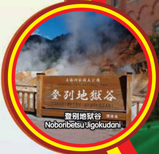
登别地狱谷 Noboribetsu Jigokudani