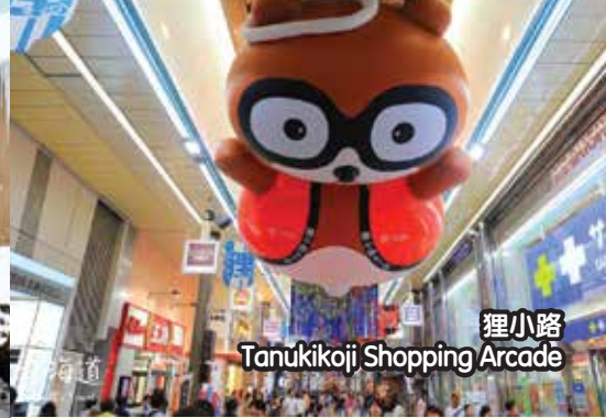
狸小路 Tanukikoji Shopping Arcade