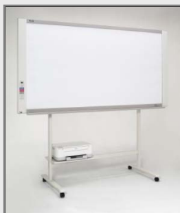
M-18W Wide model