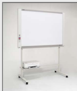
M-18S Standard model