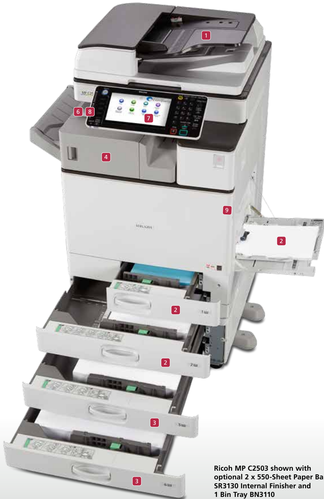
Ricoh MP C2503 shown with optional 2 x 550-Sheet Paper Bank, SR3130 Internal Finisher and 1 Bin Tray BN3110